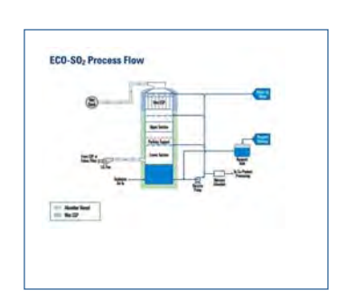
ECO-SO2 Flow Diagram

ECO-SO2 Technology Slated for Use at AMP Ohio Proposed Plant-American Municipal Power-Ohio, Inc. (AMP-Ohio) has committed to the use of Powerspan's emission control technology on the proposed American Municipal Power Generating Station (AMPGS) Project and has executed a memorandum of understanding with The Andersons, Inc. to process and market the ammonium sulfate fertilizer by-product of the process. The project is under development near the Ohio River in southern Meigs County, Ohio. proposed 1,000 megawatt (MW) facility will utilize pulverized coal and incorporate the best of the latest generation of available and proven emissions control technology to ensure that it meets or exceeds all environmental regulations and emissions limitation requirements. The pollution control technology developed by Powerspan achieves outlet emissions levels at or below those of best available control technologies and produces a fertilizer coproduct verses a synthetic gypsum produced from traditional limestone scrubbing technologies. The AMPGS plant will use the ECO-SO2 technology to control sulfur dioxide emissions with co-benefits for control of mercury and particulate matter. In addition, the Powerspan system will be designed with features that allow for future expansion to make the plant "CO<sub>2</sub> capture ready," preparing the plant for the possibility of future CO<sub>2</sub> emission limits.